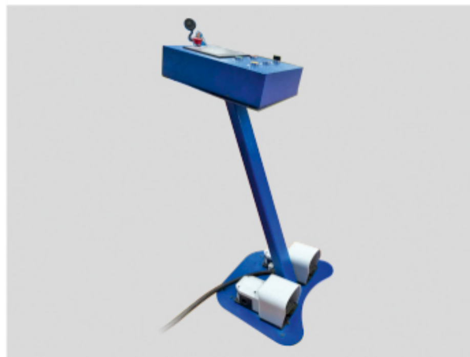
Movable foot switch with controller