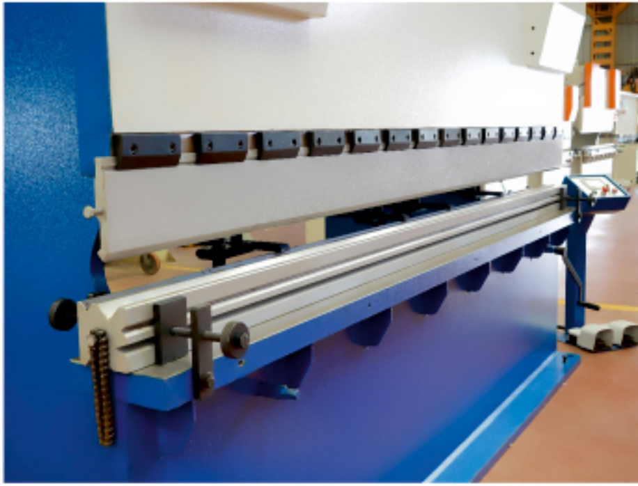
Multi v die and punch with standard clamping