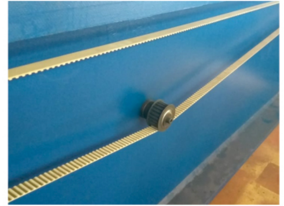
High speed servo driven back gauge with timing belt