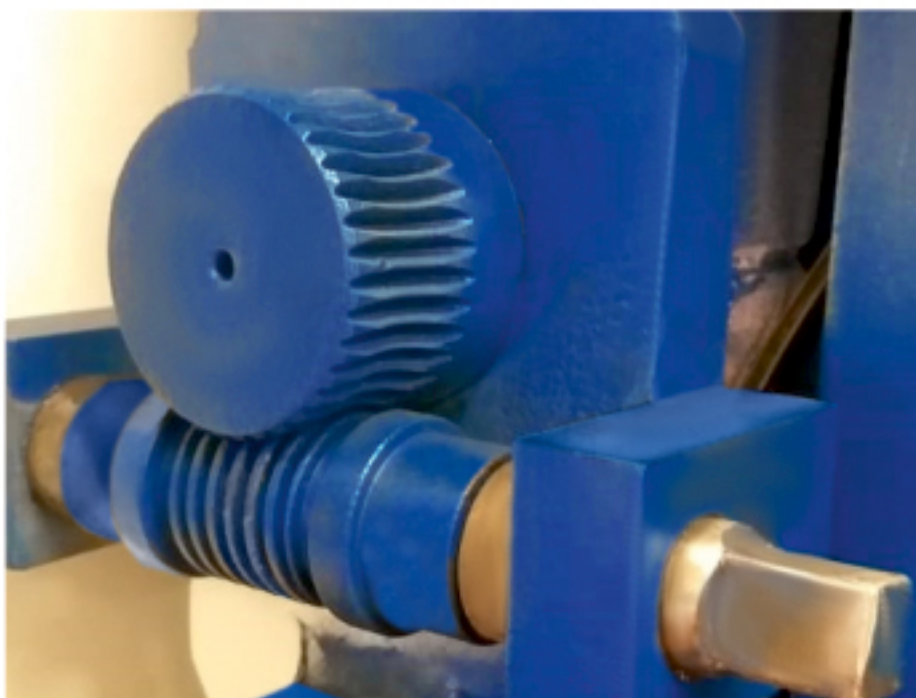
Ram tilting arrangement