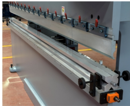
Imported Grinding Tooling