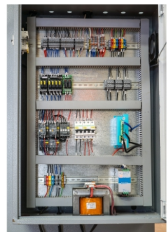
Electric Panel Schneider