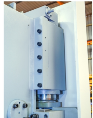
Positive Cylinder Mounting