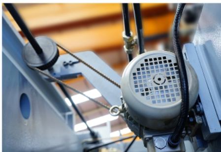
Y-axis Depth Adjustment